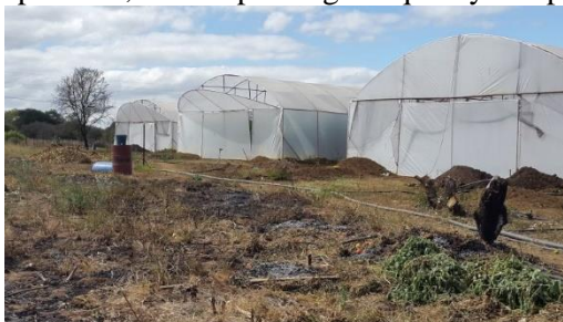
Figure.4. The use of translucent UV-resistant polyethylene film can help in reducing atmospheric contamination and pollution and control of inside air temperatures

Physical contamination: The open Spirulina production systems are prone to atmospheric pollution and contamination with insects, birds (feathers) and their droppings, plastics, soot and smoke particles (Grobbelaar, 2003). Also the freshwater attract aquatic insects such as Ephydriidae (brine flies), Corixidae (water boatmen) and Chironomidae (midges) (Grobbelaar, 2003). However by covering the open Spirulina production systems with clear 0.15 mm-thick translucent UV-resistant polyethylene film can help in reducing atmospheric contamination and pollution (Habib, 2008). These plastic covers will allow the entry of sunlight energy reduce the presence of aquatic insects and allow a control of air temperature, thus improving the quality of Spirulina (Figure 4).