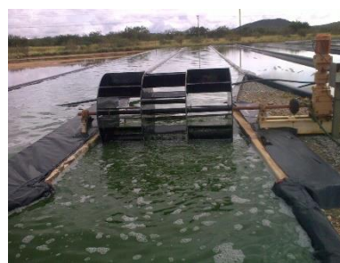
Figure.2. Static bioreactors and growth conditions

The cultivation of Spirulina in open channel raceway bioreactors in Musina, Limpopo, South Africa (Figure.3). The use of mixotrophic and heterotrophic nutrition based on organic substrates of the Arthrospira species leads higher biomass and productivity in comparison with autotrophic nutrition. The up-scaling of mixotrophic and heterotrophic modes of nutrition is expensive due to the cost in purchasing of organic substrates and microbiological contamination of Arthrospira species, partly due to presence of fungi and bacteria that may out-compete the Arthrospira species in the utilization of organic substrate (Grewe & Pulz, 2012).